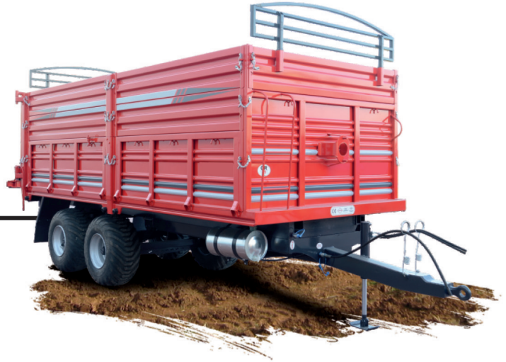
AOT 519 12 TONNE Double-Axle Trailer With Tandem System

Volume - 11.5 m 3 Weight - 2360 kg Hydraulic - 4 Position Chromed Movable Head