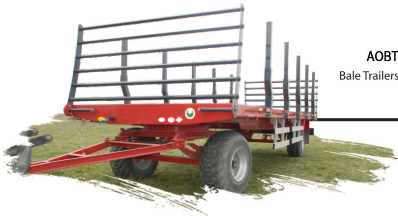
AOBT 606 6 TONNE Bale Trailers 608 8 TONNE 610 10 TONNE 613 13 TONNE