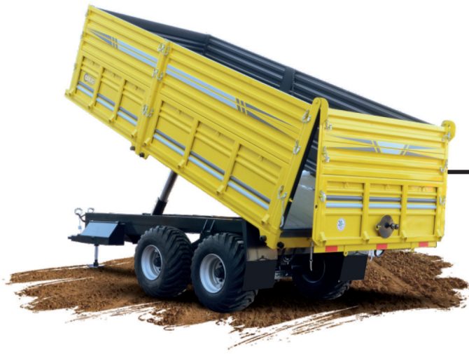
AOT 518 8 TONNE Double-Axle Trailer With Tandem System

Volume - 11.5 m 3 Weight - 2360 kg Hydraulic - 4 Position Chromed Movable Head