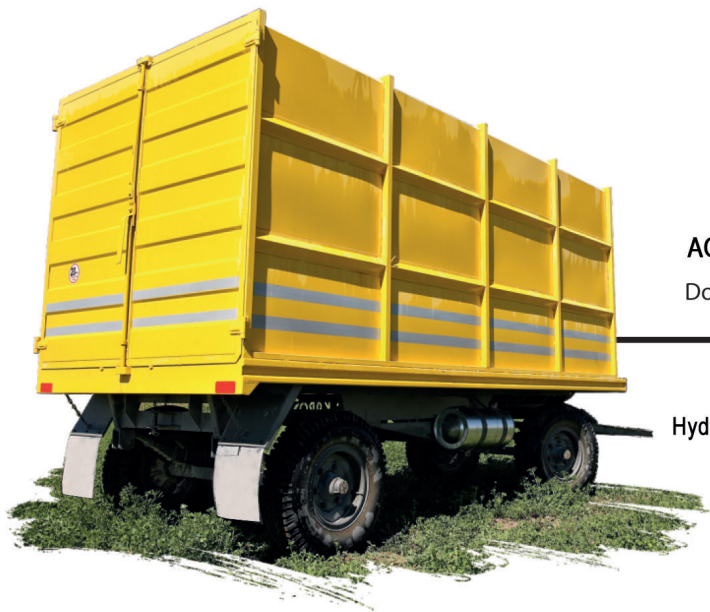
AOT 508 2.5 TONNE Double-Axle Straw Container

Volume - 13 m 3 Weight - 1450 kg Hydraulic - 3 Position Chromed Movable Head