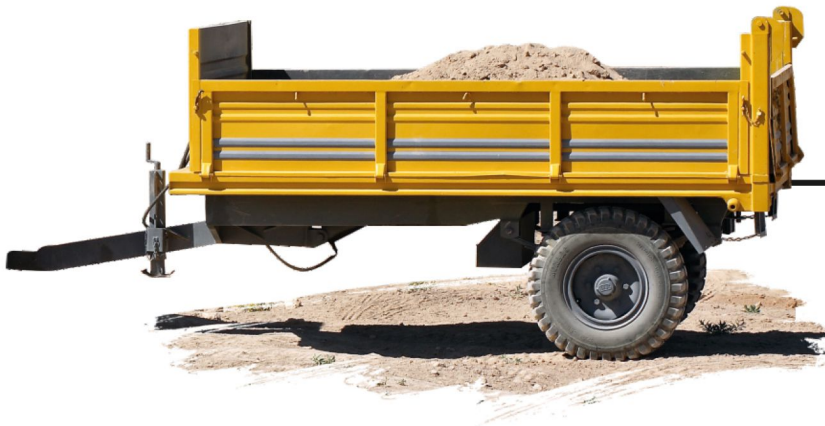
AOT 501- AOT 501 B 3 TONNE Single-Axle Trailer

Volume - 4.5 m 3 / 3.5 m 3 Weight - 1350 kg / 1120 kg Hydraulic - 3 Position Chromed Movable Head