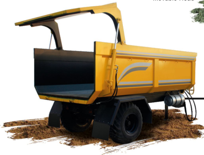
AOT 401H 6 TONNE Single-Axle Monocoque Trailer

Volume - 7 m 3 Weight - 1800 kg Hydraulic - 3 Position Chromed Movable Head