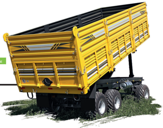
AOT 521 Special 20 TONNE 3 Axle 6 Tire Trailer

Volume - 16 m 3 Weight - 3380 kg Hydraulic - 4 Position Chromed Movable Head