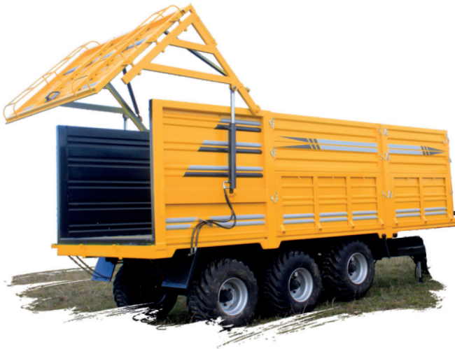
AOT 520 Special 15 TONNE 3 Axle 6 Tire Trailer With Tandem System

Volume - 12.5 m 3 Weight - 2600 kg Hydraulic - 4 Position Chromed Movable Head